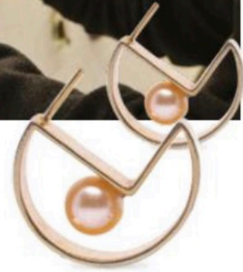
Floating Pearls 2.0 Collection by DF ARTelier

of the goldsmith's art, showing its timelessness and, therefore, its contemporaneity. While waiting for June 2021, you can flip through the following pages, where you'll witness modern and traditional techniques, creativity and inspiration, fluidity and rigidity. All the pieces shown in this insert are very different from each other: precious metals such as gold and silver against leather, precious stones against ashes, lost wax against laser cut.