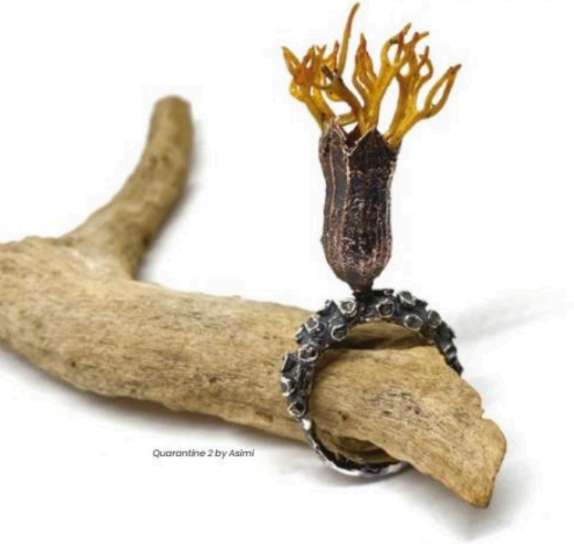
Quarantine 2 by Asimi

/ITALY milanojewelryweek.com @milanojewelryweek