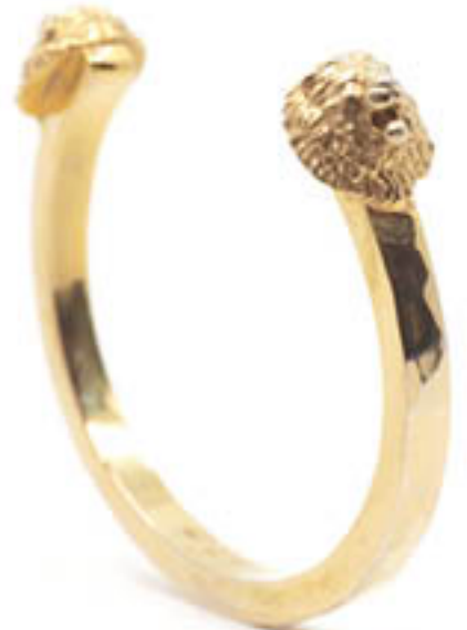
Believe Collection bangle

The lines of the collection follow the criteria of the golden section, a proportional ratio used in architecture since ancient times. The big ring is made of gold-plated 925 silver, with Kyanite cabochons. The base of the ring, with a satin finish, is adjustable.