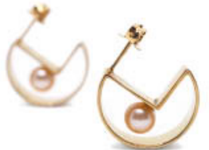
Floating Pearls 2.0 Collection earrings

The bold necklace is made of gold-plated 925 silver, with Kyanite cabochons. The chain emphasizes the slender shape of the wearer.