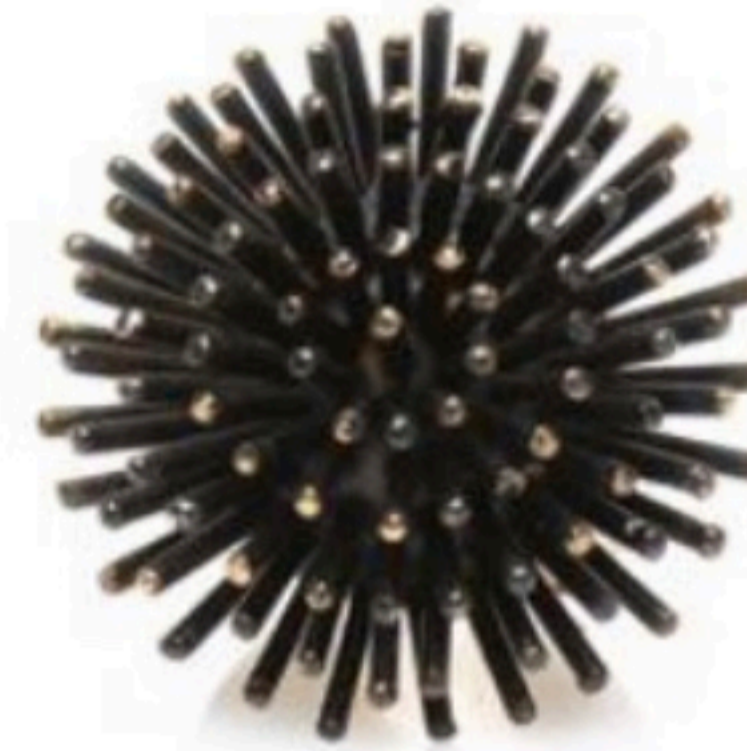
Riccio di mare by Autofocus gioielli

to involving operators as it usually happens with the most traditional events in the field, but has allowed beauty and craftsmanship's lovers to approach the fascinating world of jewelry. Collective and personal exhibitions, talent shows with academies from all over the world, international galleries, workshops, performances, temporary shops and awarding nights have shown multi-faceted interpretations of the history and techniques